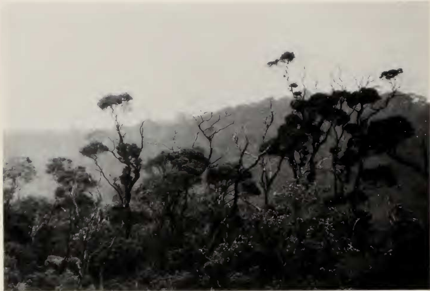
FIG. 2. Profile of forest canopy in the study area showing emergent 'ohi'a snags.

cludes abundant mosses and ferns as well as flowering plants.